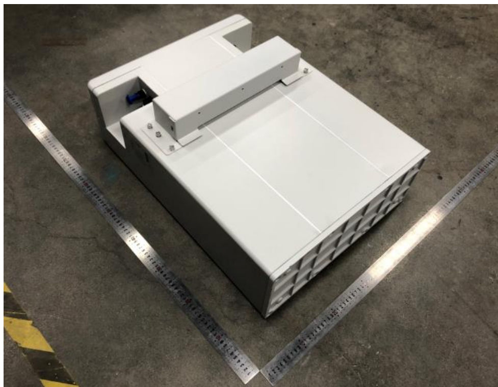
图 2 电池背面 Picture 2 Back view of Battery