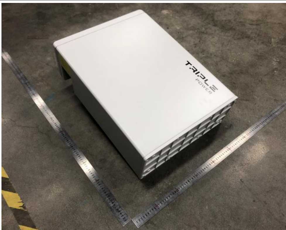
图 1 电池侧面 Picture 1 Side view of Battery