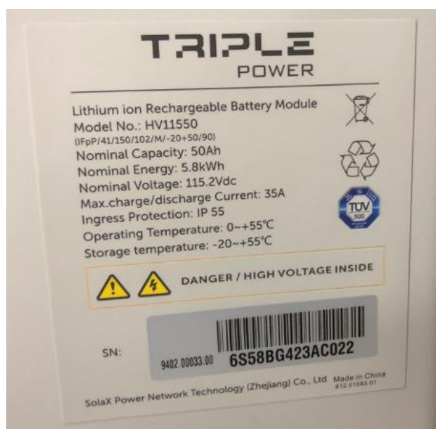
图 4 电池标签 Picture 4 Label of Battery